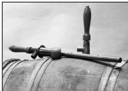
Bordeaux Style Wine Barrel Steam Wand

Tartrates which deposit on the inside surface of wine barrels are typically removed by melting and rinsing. When hot water is used, the typical temperature delivered to the barrel is rarely above 180° F. In comparison, when steam is utilized, the temperature inside the barrel reaches 212° F. As a result, substantially more heat is available to melt the tartrates. In addition, the latent heat of vaporization delivers additional heat making the process even more effective.