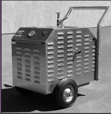
16400 Swash™ Steam Generator